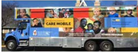
Two Ronald McDonald Care Mobile® Programs