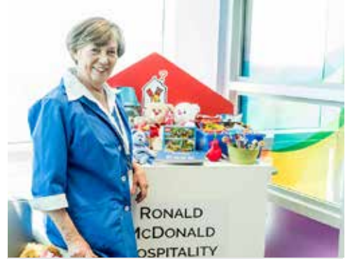
Two Hospitality a la Carte Programs