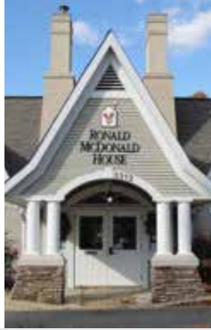
Two Ronald McDonald House® Programs