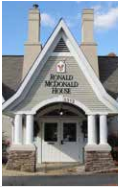
Two Ronald McDonald House® Programs