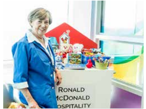
Two Hospitality a la Carte Programs