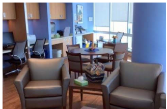
Ronald McDonald Family Room® at Inova 3300 Gallows Road Falls Church, VA 22041 P: (703) 776-8060