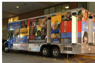
KIDS Mobile Medical Clinic/ Ronald McDonald Care Mobile® serving Southeast Washington, DC Wards 4-8 P: (202) 444-8888