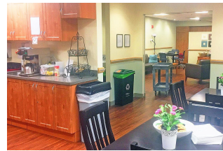
Ronald McDonald Family Room® at CNH 111 Michigan Avenue NW Washington, DC 20010 P: (202) 476-4205