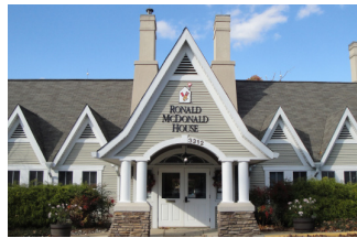
Ronald McDonald House® of Northern Virginia 3312 Gallows Rd. Falls Church, VA 22042 P: (703) 698-7080