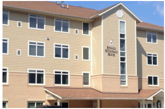
Ronald McDonald House® of Washington, DC 3727 14 th St. NE Washington, DC 20017 P: (202) 529-8204

Every year, more than 10,000 children are served across our three core programs.