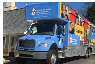
Ronald McDonald Care Mobile® FITNESS Program serving Washington, DC public schools P: (202) 444-8888